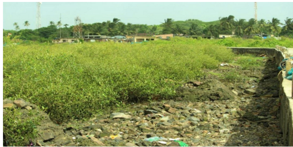
Fig. 2. Mangrove species diversity location photo at Dativare Jetty site.