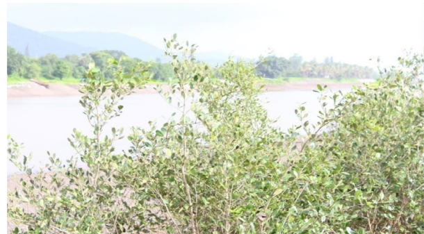
Fig. 4. Mangrove species Photo location at Wadhiv site.