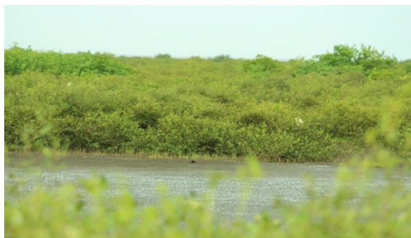
Fig. 3. Mangrove Population Photo at Vaitarna Bridge.

Sonneratia Sps. , Rhizophora mucronata etc. were found (Athalye,2013). In 2014 studied biodiversity of mangroves in estuarine ecosystems of Ratnagiri District, Maharashtra, shows biodiversity of mangroves with 20 species with 15 genera. Sonneratia , Avicennia were the more common genus with three species each (Naikwade, 2014) and in 2017 (Mulla and Chavan, 2017) recorded 7 families and 11 species of man-